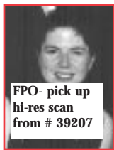
FPO- pick up hi-res scan from # 39207

Fall is in the air. Like Heinz ketchup, this is the season when many of us still experience twinges of joyful anticipation that likely became rooted when we were kids. After enjoying those grilled hamburgers of our youth, the arrival of fall meant heading back to school, buying new school supplies, seeing old friends, and making new ones. For some of us, brisk mornings and sun-licked