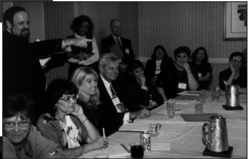
Discussion Group participants enjoyed a lively exchange.