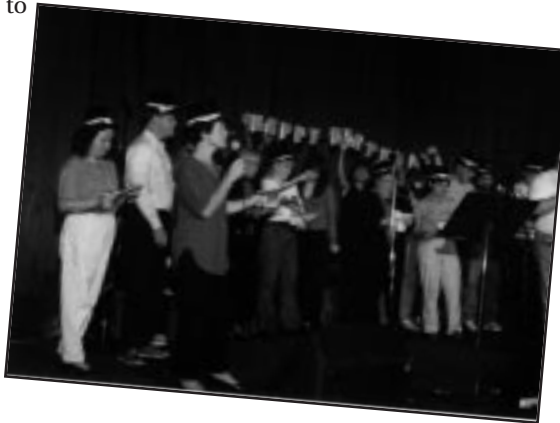
Model of a Modern Contract Specialist