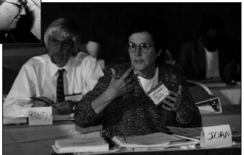
Almost half of Annual Meeting attendees participated in Workshop '98