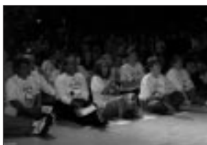
Region III Members cheer their entry