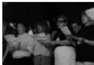
Region V with an ode to the NCURA Staff