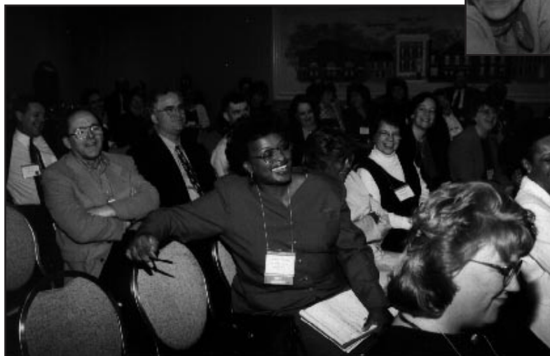
A senior research administrators session brought information and humor.