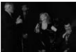
Region II's entry in the birthday salute